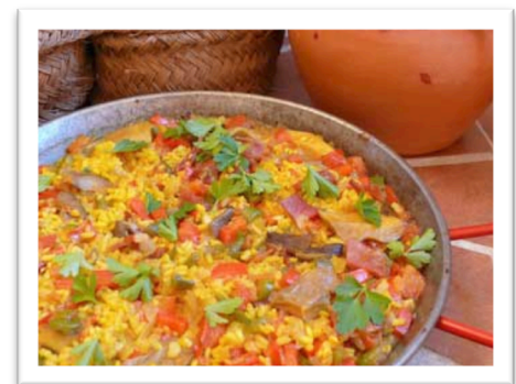
Serrano Ham Paella